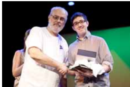
Get Over Yourself Gray Academy