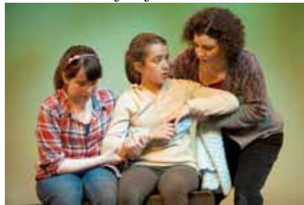
Tec Voc High School