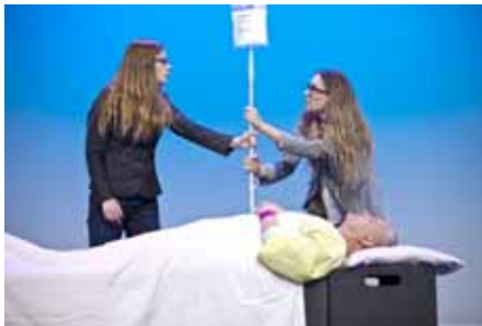
Error Gimli High School